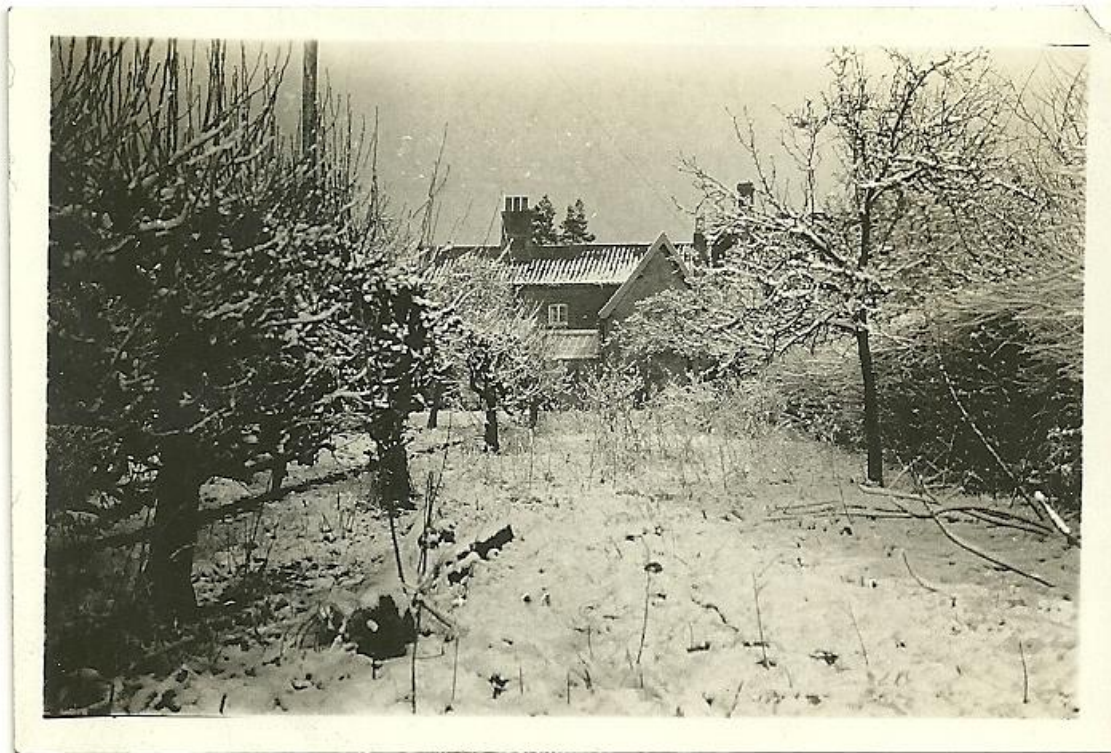
The garden at the rear of the shop in New Buckenham.