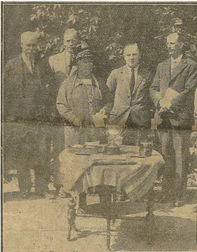
Newspaper cutting - Sat August 8 th 1931